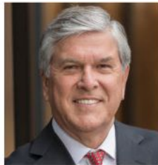
Gordon H. Smith President & CEO National Association of Broadcasters