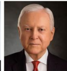
Orrin G. Hatch Emeritus Chairman Orrin G. Hatch Foundation

Registration is free to all attendees. Business casual dress encouraged.